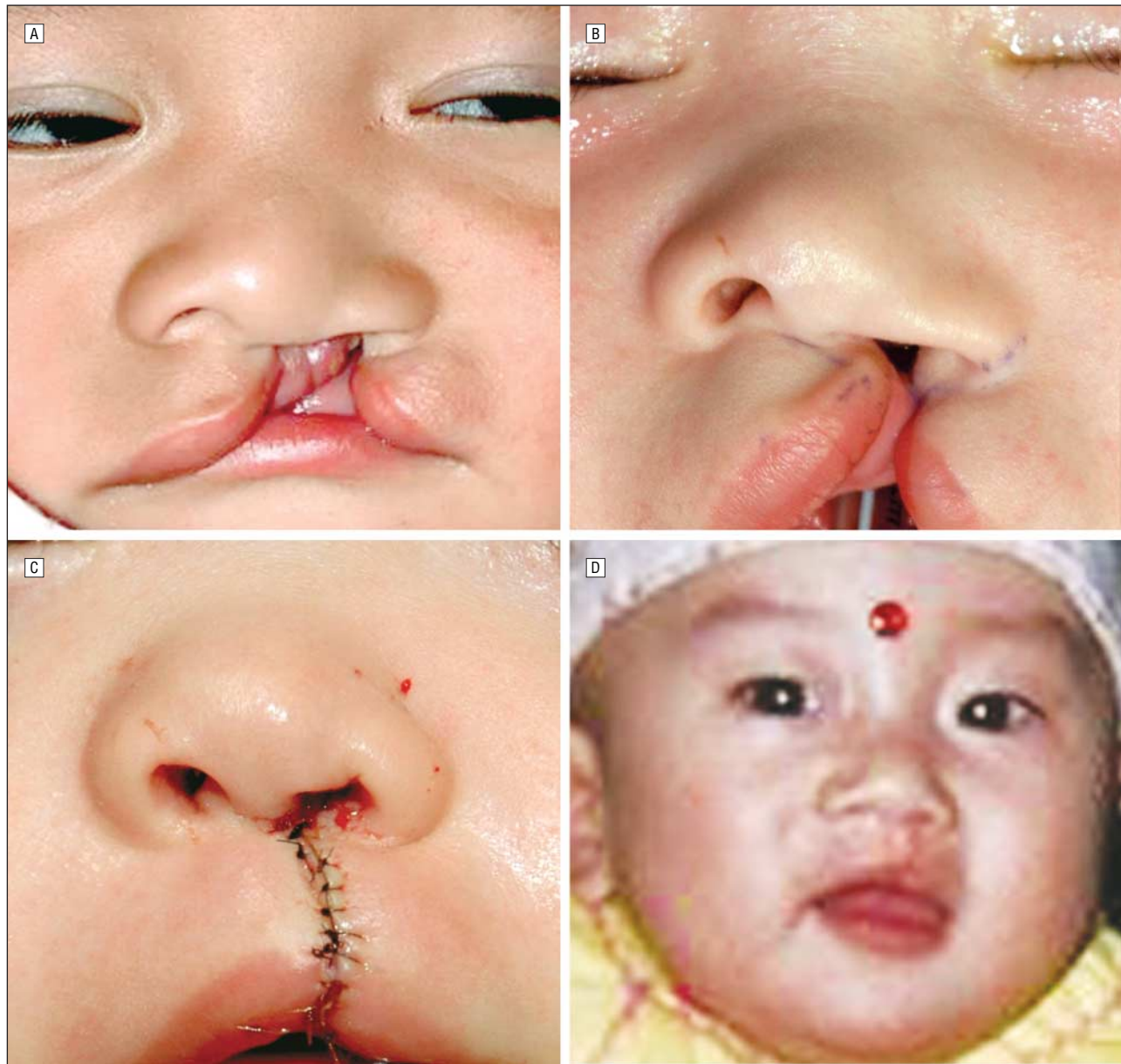
Figure 3. A, Preoperative photograph of an 11-month-old child with a left cleft lip-palate that includes the alveolus. Note the left alar hooding; columellar and caudal septal deflection to the noncleft side; displacement of the alar base laterally, posteriorly, and inferiorly; and asymmetric tip, as represented by the light reflection on the right tip-defining point only. B, Intraoperative view before the left cleft lip repair and tip rhinoplasty. C, Intraoperative view immediately after the cleft lip repair and placement of the triangle fixation suture to enhance the left alar crease and to reposition the lower lateral cartilage. D, Four-month postoperative view.