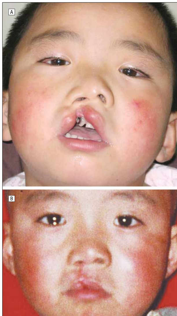
Figure 2. A, Preoperative photograph of a 4-year-old child with an unrepaired right cleft lip. Note the decay of maxillary dentition. B, Four-month postoperative photograph. The postoperative photographs were obtained during follow-up by Lu Shouchang, MD, DDS.

Different techniques of cleft lip-palate revision were used. A 4-year-old boy with a previously repaired right-sided cleft lip-palate had at least 3 identifiable abnormalities. First, lateral displacement of the cleft-side nasal base and the hooding of the ala resulted in asymmetry of the alar margin and the nostril size and shape ( Figure 4A ). Second, red lip (mucosa) was deficient at the closure site. Although the wet-dry lip junction was well aligned, fullness of the lip in the vertical and horizontal planes was lacking ( Figure 4B ). Techniques to avoid this secondary deformity at the primary repair include a white roll flap and meticulous attention to reapproximation of the orbicularis oris using a vertical mattress suture to establish balanced lip fullness. Third, the unrepaired cleft alveolus and malpositioned dentition would require bone grafting of the alveolar cleft after presurgical orthodontic preparation ( Figure 4C ). The following procedures were performed in this case: the lip scar was excised, the alar base width was set with